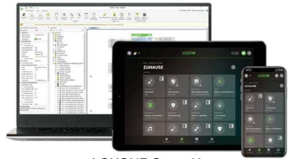
e.g. LOXONE Smart Home