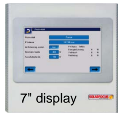
SOLARFOCUS eco manager-touch